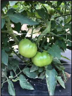
Perfect tomatoes that won’t ripen!

Unfortunately, there isn't much to be done when it comes to dealing with these extreme temperature swings. Mulching and providing sufficient water, while waiting for temperatures to go back down, is always helpful.