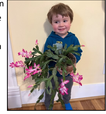
My son with a Thanksgiving cactus that belonged to his great-great-grandmother.

Epiphytic cacti require a well-drained potting soil. The branches of holiday cacti may become limp and shriveled if grown in a compacted, poorly drained soil. Although a member of the cactus family, a holiday cactus should not be kept dry like its relatives. During the summer, you can move them outdoors to a partially shady location. If you buy a holiday cactus during this holiday season, this could be the gift in your family that keeps on giving! Source: Iowa Extension Horticulture.